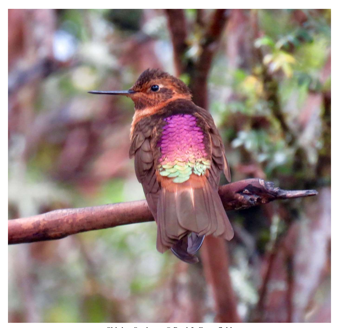
Shining Sunbeam