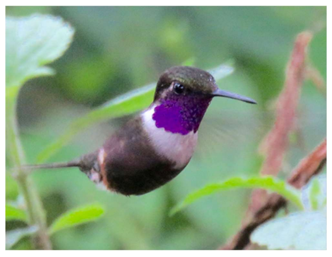
Purple-throated Woodstar

March 15, Day 5: Return to Quito via Amagusa-Mashpi Reserve and Alambi Cloud Forest Reserve. We will depart this morning after breakfast and initiate our return to Quito, but first by heading farther to the west the Amagusa-Mashpi Reserve, which is owned and managed by a local Ecuadorian couple. This is a special place where nectar and, especially, plantain banana feeders have been set up; targets here include Glistening-green, Rufous-throated and Moss-backed tanagers; along with Golden-collared Honeycreeper. The incredible Chocó regional cloud forest in this area is quite amazing and we will also take some time to look for special endemics like Pacific Tuftedcheek; Uniform Treehunter; Black Solitaire; Orange-breasted Fruiteater; and Indigo Flowerpiercer; among the many possibilities. After most of the morning here, we will then return eastward to visit a local friend at Alambi Cloud Forest Reserve to check out his unbelievably active nectar and fruit feeders. This is an impressive site that offers mind-boggling activity and good photo ops, if we haven't had enough already! We will then initiate our final push to the big city and the finale to Part I of our Extravaganza.