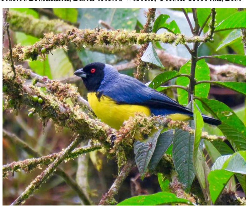
Hooded Mountain-Tanager

and-yellow Tanager; along with Black and Rusty flowerpiercers; then we'll pass through Polvlepis woodland, páramo shrub- and grassland, continuing down into humid temperate forest, as we descend the eastern Andean slope. Along this stretch, we will reach Guango Lodge by around midday for an enjoyable lunch and a brief immersion into the insane frenzy of hummingbird action at the lodge's fabulous nectar feeders and with a bit of luck some flock activity might spring up. Among the many possibilities to be found here, we will especially be watching for Tourmaline Sunangel: Speckled Hummingbird; Long-tailed Sylph; Mountain Avocetbill (rare); Glowing Puffleg; Collared Inca; Mountain Velvetbreast; Buff-tailed and Chestnut-breasted coronets; White-bellied Woodstar; and the incredible Sword-billed Hummingbird, along with possibilities of Woodpecker: Powerful Strong-billed