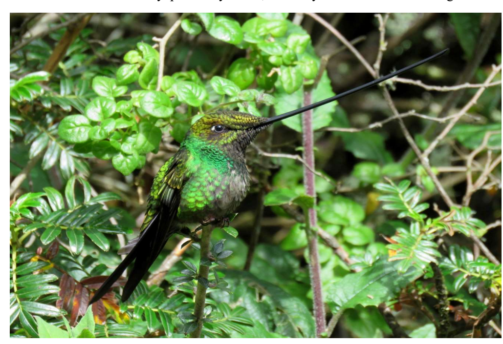
Sword-billed Hummingbird

to-face with yet another swarm of hummers, including Collared Inca; White-booted Rackettail: and Gorgeted Sunangel, along with periodic visits by a few Blue-winged Mountain-Tanagers. We will have to pry ourselves from this frenzy to continue to west-slope destination and 'center of operations' for the next few days, but we will be on constant watch for the eventual mixed-species foraging flocks that could hold Blue-capped; Grassgreen & Blue-and-black tanagers; along with the