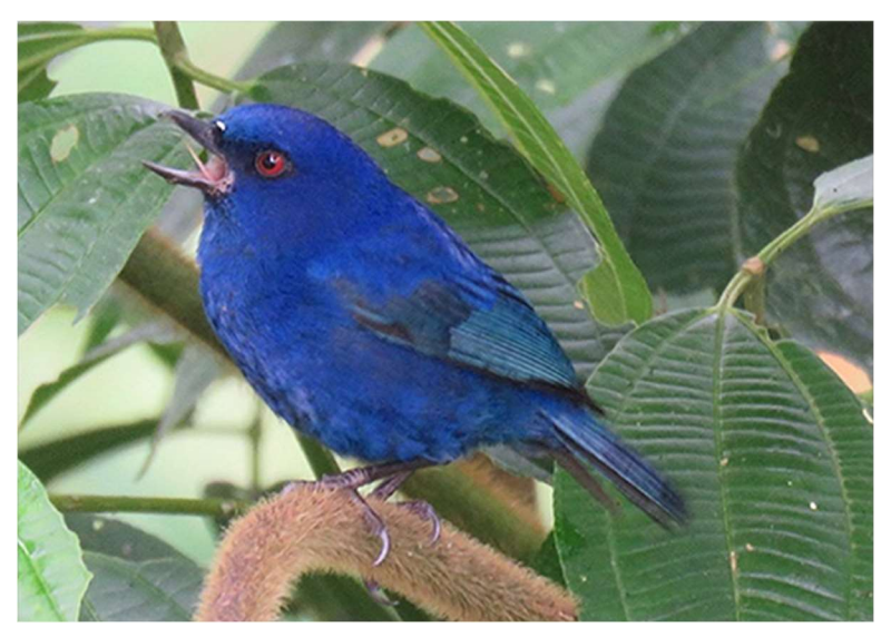
Indigo Flowerpiercer (Amagusa-Mashpi Reserve)

March 16, Day 6: Birding the Antisana Area and Papallacta Pass and then onward to Wildsumaco Lodge. This morning, after a sumptuous buffet breakfast, we initiate Part II of our journey as we depart from our hotel (we may come across Blue-and-yellow & Scrub tanagers and a few other species on the hotel grounds before we