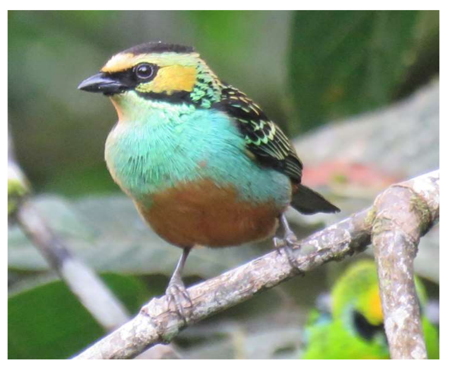
Golden-eared Tanager (Wildsumaco Lodge)

This tour is one in our series of Relaxed & Easy (R&E) tours. These tours are appropriate for participants who want a slower paced tour, with somewhat fewer hours in the field and light physical activity. They are ideal for persons who prefer a somewhat later start in the morning (typically 7:00 a.m.), a break after lunch and a shorter afternoon outing. They involve only short walks, usually not more than a half mile, and avoid difficult terrain.