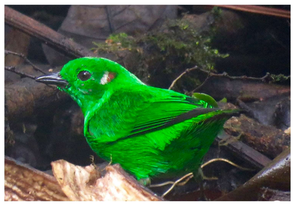
Glistening-green Tanager

<u>March 20, Day 10: Departure for Home</u>. A transfer will be provided to the Quito Airport in time for all departures.